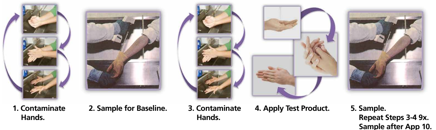
Figure 1. Steps for E 1174

The objective of this study was to determine if efficacy of products when tested at the amount dispensed from a wall-mounted dispenser (1.3 ml) is sufficient to meet the efficacy requirements for Health Canada.