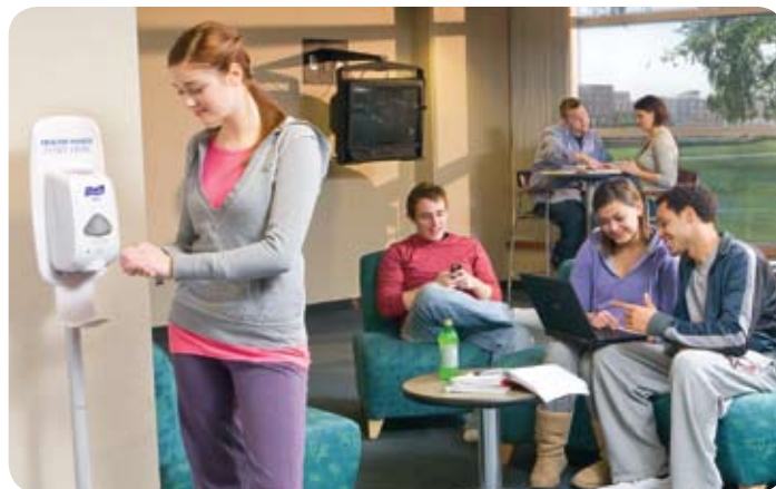
PURELL, America's #1 instant hand sanitizer, makes effective hand hygiene simple anywhere.