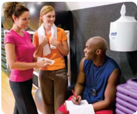
Conveniently clean and sanitize, perfect for recreation centers