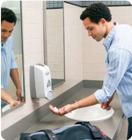
High-capacity, SANITARY-SEALED systems simplify maintenance.

Everywhere students gather, share materials, and connect, you can promote a healthy campus attitude. Your GOJO comprehensive solution makes hand hygiene available and highly visible.